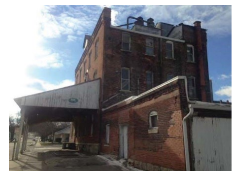
Looking south at the Property

According to fire insurance maps, a fuel room was located on the property from 1899-1914 with coal being identified as the primary fuel source. Ashes from coal were commonly disposed of on-site representing a REC to the property. According to the same maps, auto repair shops were located as close as 80 ft. south of the property that could have had cutting oil, solvents and heavy metal contaminants seep down to the mill property. The maps also indicated a dry-cleaning shop close to the property that could have leaked chlorinated solvents onto the mill property. Finally, the maps showed that a gasoline tank was located near the property leading to additional environmental concern. Given the age of the original building, it was believed that it contained asbestos and lead contamination. The phase I assessment recommended additional assessment work and possibly remediation.