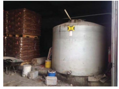
Interior tank and oil containers

The property was sold to a developer in 2020, and it is unclear if additional assessment work was completed. Asbestos abatement was completed prior to renovation but unknown if any other remediation was completed.